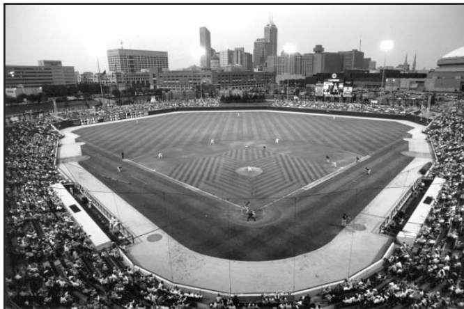
Victory Field celebrated its 10th anniversary in 2006.

A batted ball landing on the small roof area in the left-field corner on top of the power room is a home run.