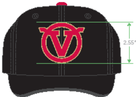
Home Cap ("Branded V" logo)