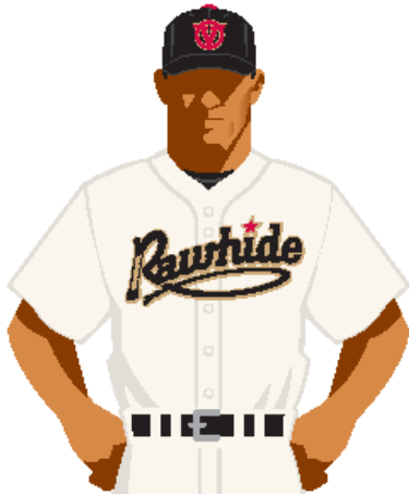
Home Uniform (off-white)

Primary Logo Colors: Scarlet, Black, Tan