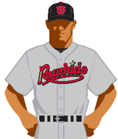
Road Uniform (grey)