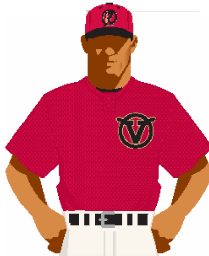
BP Jersey (scarlet mesh)