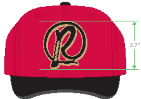
Road Cap ("Roping R" logo)