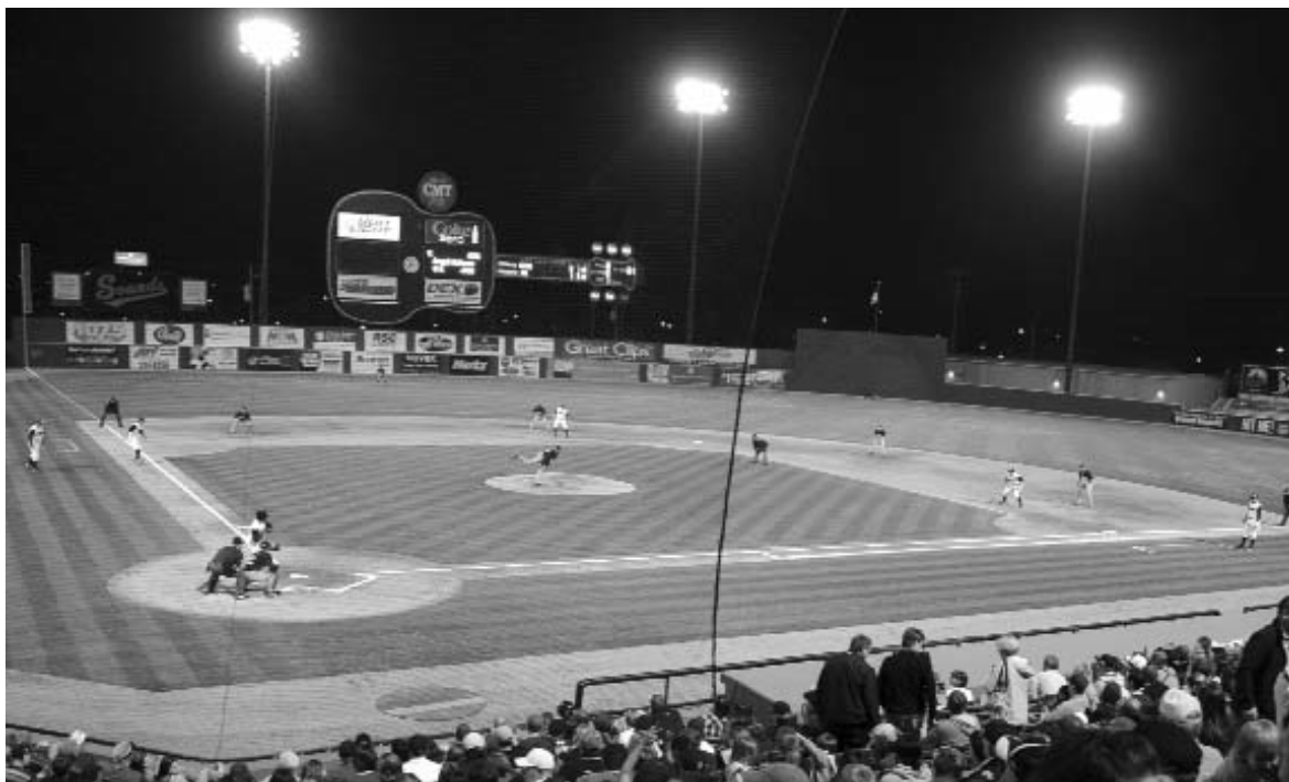
Herschel Greer Stadium

Opened: 1978 Capacity: 10,300 First Game: April 26, 1978 vs. Savannah (Sounds won, 12-4)