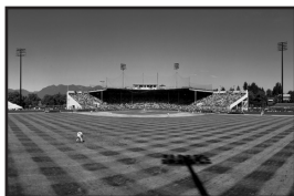
Nat Bailey Stadium