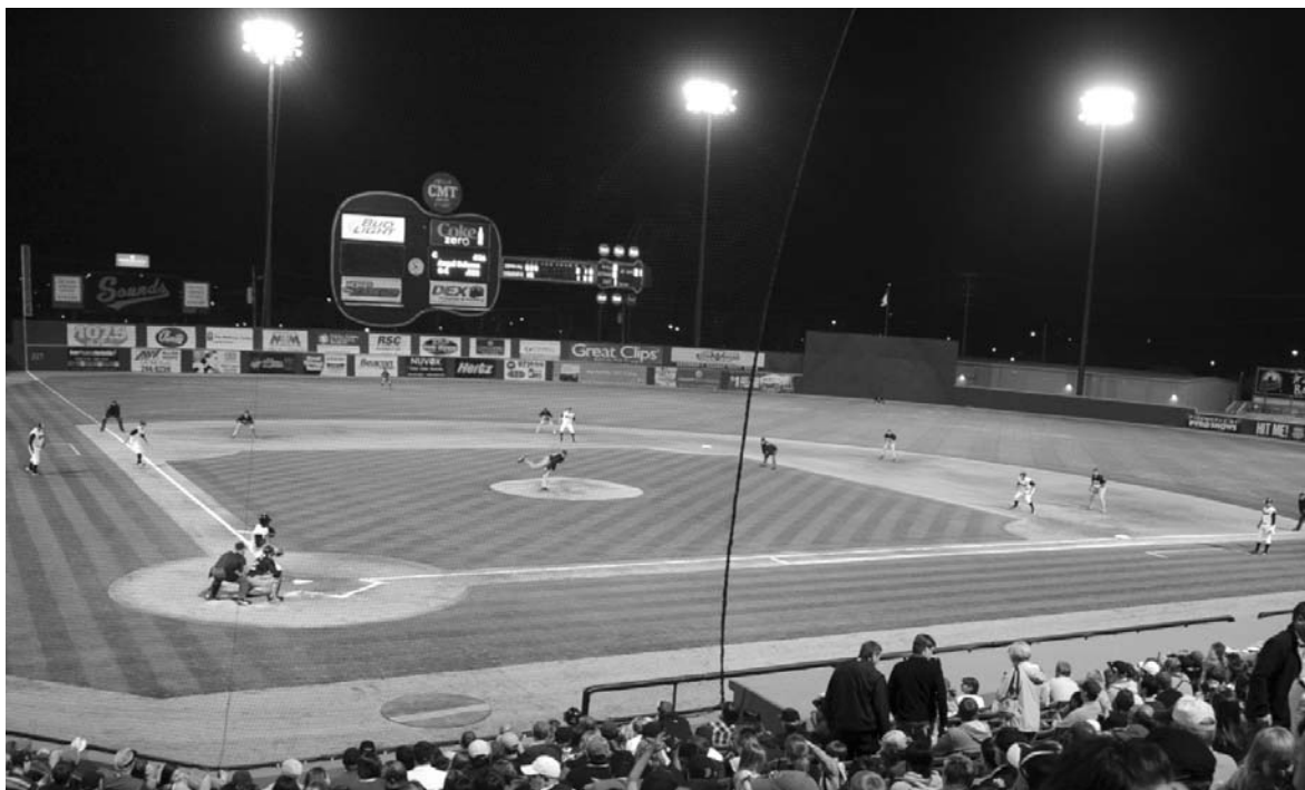
Herschel Greer Stadium

Opened: 1978 Capacity: 10,300 First Game: April 26, 1978 vs. Savannah (Sounds won, 12-4)