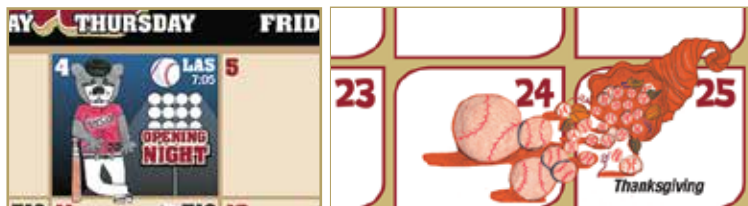
EXAMPLE OF FULL COLOR ART