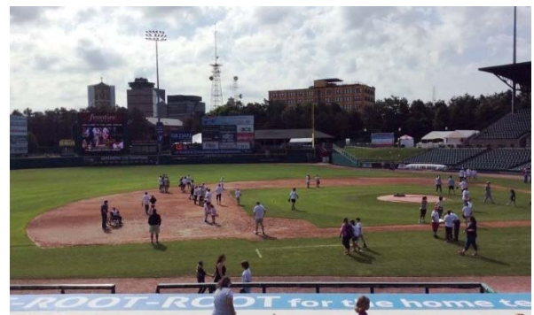
Challenger Baseball participants take the field!

A signature event hosted by the Red Wings each year, Challenger Baseball is a tournament primarily for boys & girls ages 6-18 who are physically and/or mentally challenged. 321 participated in 2015.