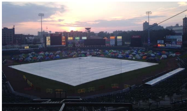
Scouts pitch their tents in the outfield.

Every season the Red Wings host SCOUT SLEEPOVERS . Postgame, troops pitch their tents in the outfield, watch a movie on the video board, and fall asleep under the stars.