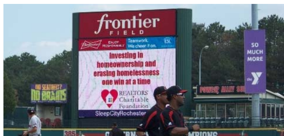
Realtors Charitable Foundation announcement is displayed.

Presented by McDonald's of the Greater Rochester Area and News 8 WROC, $50 is donated to Hillside Family of Agencies for every home run the Red Wings hit this season. Total Raised: $4750