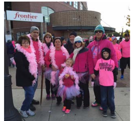
Making Strides participants

Children's Institute, BE WELL Yoga Event for the Mental Health Association of Rochester, the KIDNEY WALK , the COLOR RUN , and MAKING STRIDES to benefit breast cancer research which raised several hundred thousand dollars.