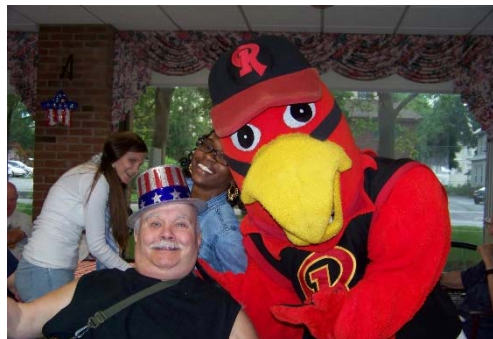
Spikes visits Wesley Gardens Nursing & Rehabilitation Facility.