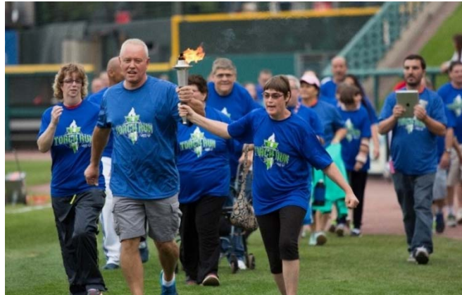
Law enforcement leads the Special Olympics Torch Run.

300-400 urban youth were welcomed to the ballpark at lunchtime for FOODLINK SUMMER MEALS . They were provided a healthy lunch and learned about nutrition. The Red Wings participated in a press conference with the Mayor and players were on hand to sign autographs.