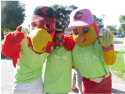
Spikes & Mittsy attend the Walking on Sunshine Event.