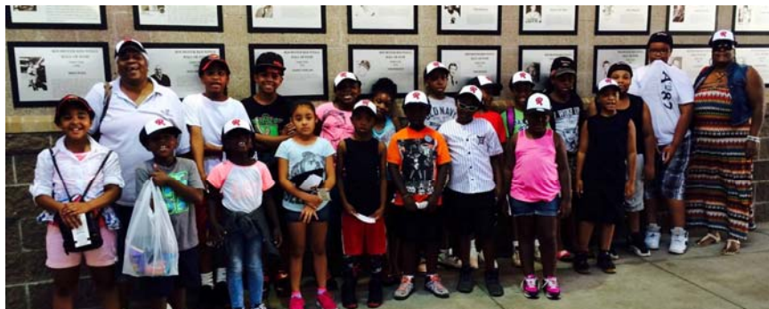
Boys & Girls Club enjoy the ballpark experience.

Harter Secret & Emery sponsored a group of Wings fans from the BOYS and GIRLS CLUB of Rochester. They enjoyed early entrance, a tour of the ballpark, great seats, lunch at the game and new Wings caps.