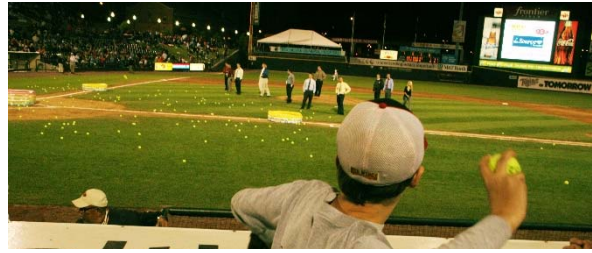
Launch A Ball participant hopes to hit the target.