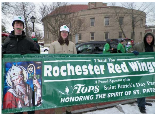
St. Patrick's Day Parade